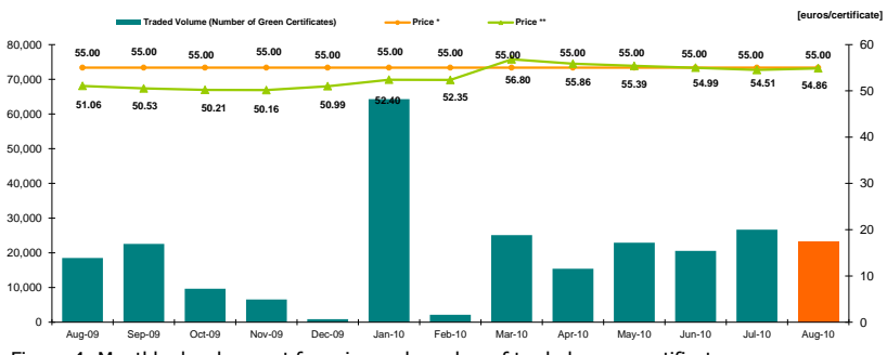
Figure 4: Monthly development for price and number of traded green certificates

*The price in Romanian currency was converted to euro using the average exchange rate for the last month of the previous year published by National Bank of Romania (BNR). This reference exchange rate respects the provisions of the Law 220/27.10.2008. For May 2009-February 2010, the value of the average exchange rate is equal to 3.9153 lei. Starting from March 2010 the value of the average exchange rate is equal to 4.2248 lei. ** The price in Romanian currency was converted to euro using the exchange rate published by National Bank of Romania (BNR) in the preceding day of the trading day.